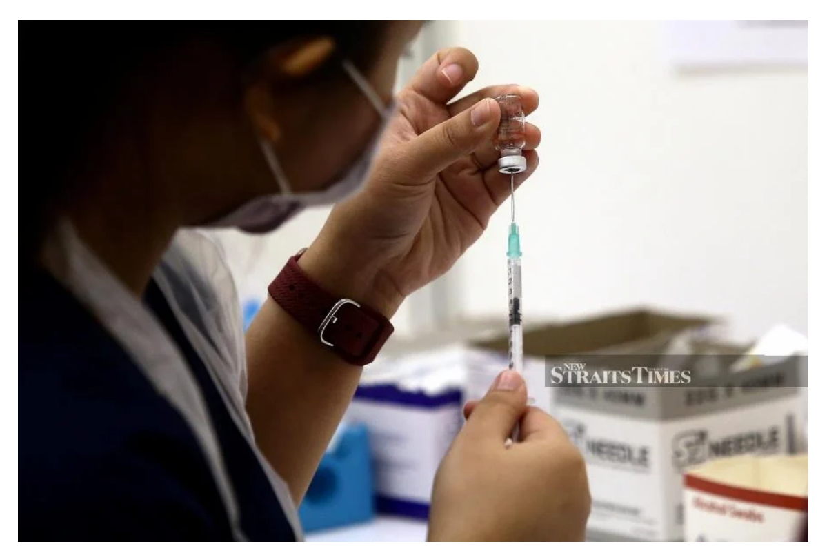
Up to 40 per cent of the adult population in the country is expected to be inoculated against Covid-19 by end of August, the Dewan Rakyat was told today.